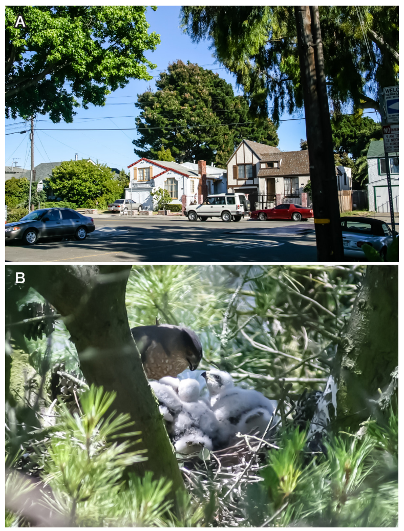
FIGURE 1. (A) Typical Cooper's Hawk nest tree, a Monterey Pine, Pinus radiata , along a Berkeley street. (B) Adult female Cooper's Hawk attending five 2-week-old nestlings.

(i.e., locations where hawks regularly remove feathers and other inedible parts of prey). We located potential nest structures prior to deciduous trees leafing out and monitored those structures through the breeding season (Figure 1). In addition, we monitored for signs of nesting activity (e.g., calling adults, flight displays, etc.) and surveyed for alternate nests (i.e., other potential nests within a nesting territory; Steenhof et al. 2017).